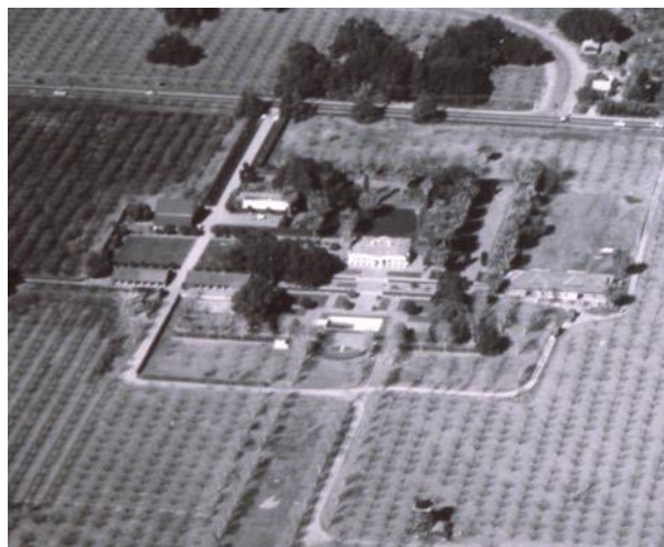
The white building in the center of the photo is Le Petite Trianon, now the California History Center. The road running horizontally behind the building is Stevens Creek. To the right of Le Petite Trianon, the Baldwin Winery building can be seen.

With funds now available, construction was set to begin in April of 1968. The chosen site for the new performing arts center was the location of a building that had been built on the property back in the late 1800s, commonly called Le Petite Trianon or The Pavillion. Le Petite Trianon was temporarily moved to an empty space behind the library while local funds were raised to restore the building. It was then moved to its present location and still stands today as The California History Center.