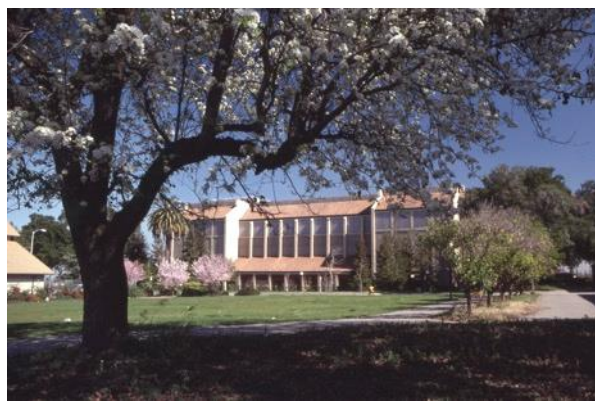
The Flint Center, as it appeared in 1979. This photo was taken near the spot where the parking garage stands

The current plan is to build an Event Center on the Flint site. The budget for such an endeavor is tight, but the college and district are reviewing all possible options for the creation of a new facility. Keep an eye on that empty space vacated by the Flint Center. You might see something new coming in the next few years.