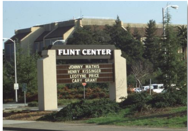
The original Flint Center sign, announcing the big names who would be appearing on stage.