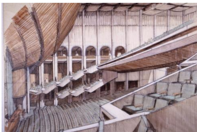
This drawing shows the original plan for the box seats, which were stacked and faced the stage. This was changed for acoustic reasons.

Since the new theater was designed to accommodate symphonies, ballets and other musical and cultural events, acoustics were