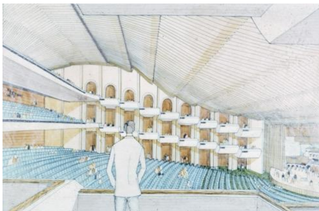
This artist's rendering of the interior shows the huge auditorium, the floor seats, two balconies and box seats, totaling 2,571 seats.

state-of-the-art lighting and fly space, excellent acoustics, make up rooms, green rooms, administrative offices and much more.