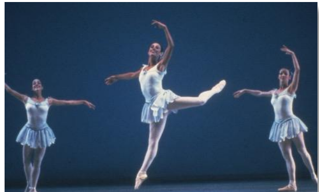
The Flint Center was designed for ballet, symphony concerts and other cultural events.